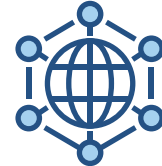
MITA SS-A Development

Get in touch with our experts to learn more, and discuss how we can work with your organization to help you better understand CMS' SMC/OBC Certification process.