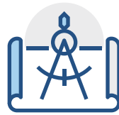
Planning & Funding Documents (APDs)