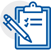
ORR/CR Preparation & Management